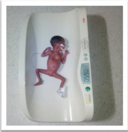
At the time of Birth.